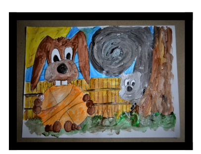
Level 1 is comparable to kindergarten-first grade level. (Ages 5-6)

Your student should master these skills at this level.